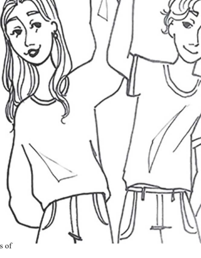
AUGIE CAPOTOSTO ILLUSTRATION

Student anxiety and reliance make restrictive policies impossible or impractical. Instead, schools should consider cell phones for their educational value and teach responsibility to ensure students properly use technology as they enter adulthood.